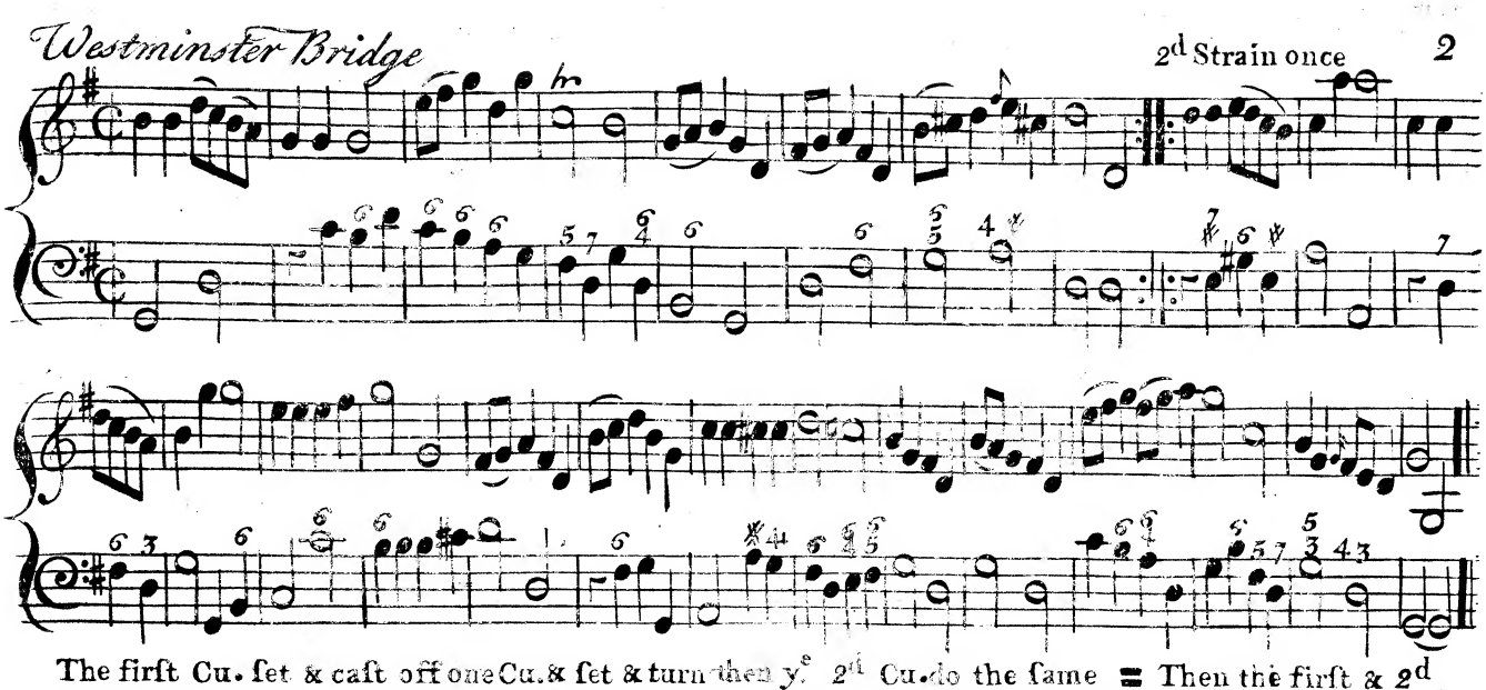
Man clap Hands, and the J_{1}^{ft} \otimes 2^{d} Wo.' clap Hands at the fame Time and then clap Hands with each Partner the first Cu. cast off one Cu. and foot it & Right Hand & left quite round =